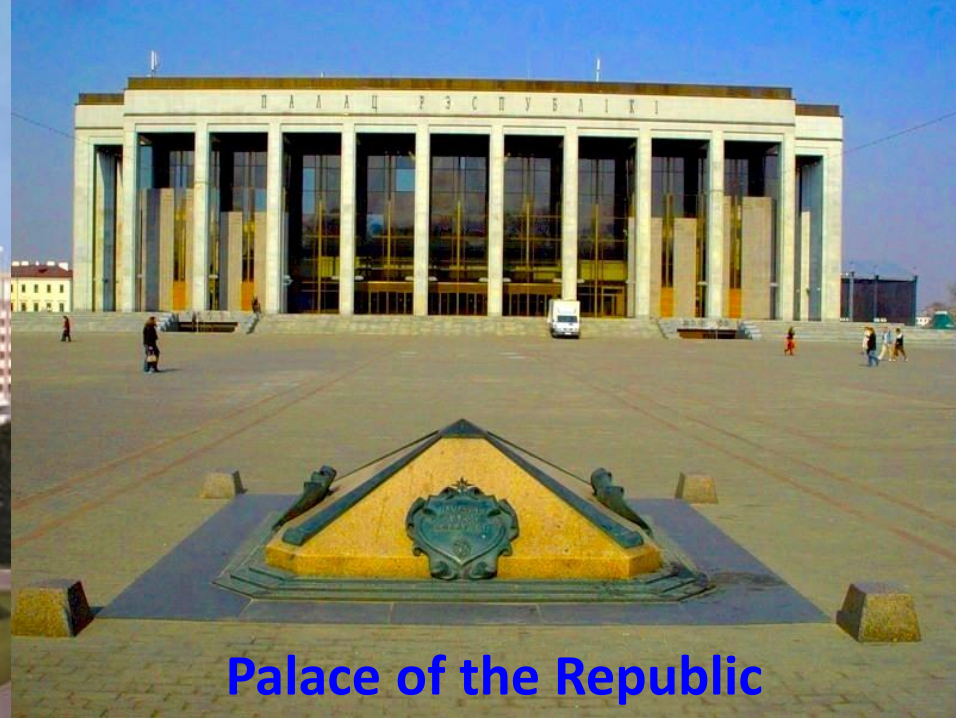
Palace of the Republic