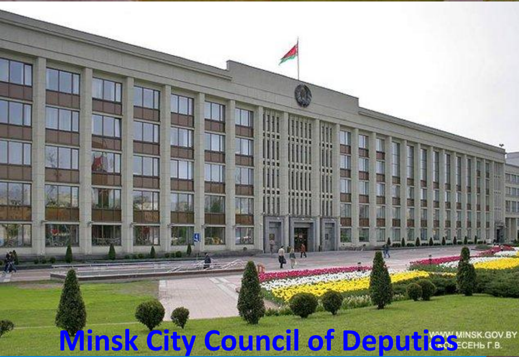
Minsk City Council of Deputies