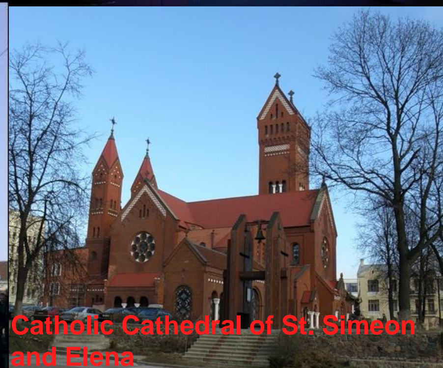
Catholic Cathedral of St. Simeon and Elena