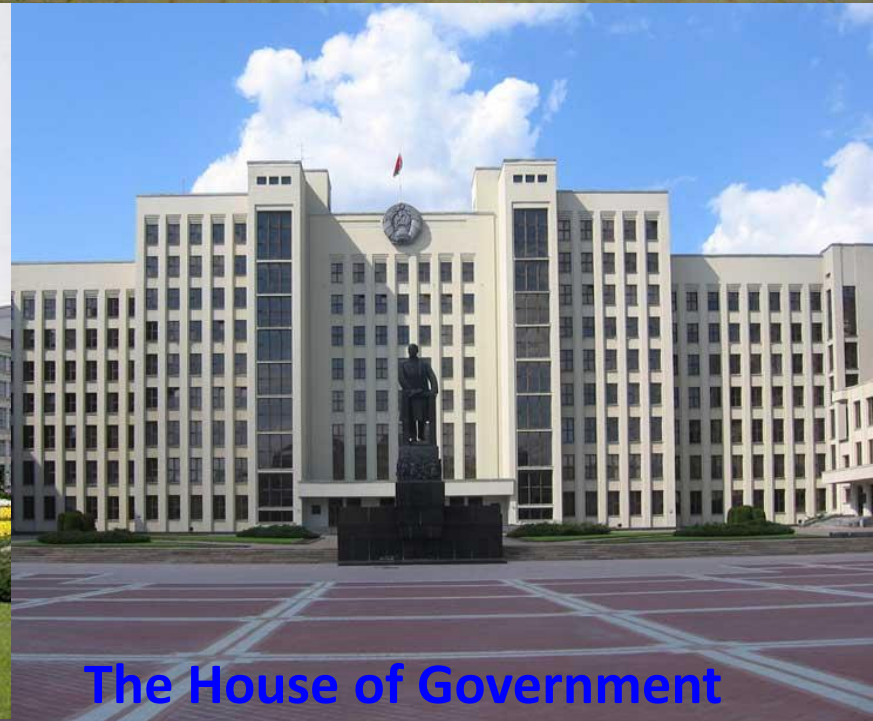
The House of Government