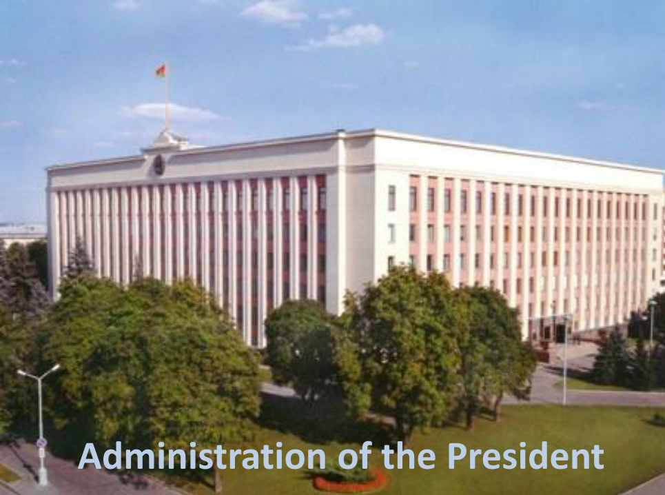
Administration of the President