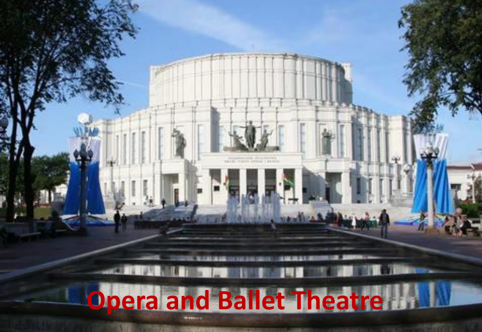
Opera and Ballet Theatre